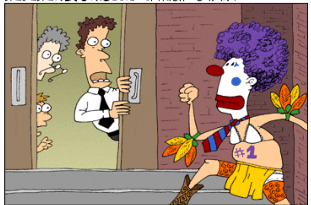
08-29-2006 THE CHURCH WAS NOT PREPARED FOR THE SURPRISE TOLERANCE DRILL