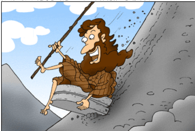
(See Exodus 34) 07-25-2006 MAN DID MOSES GET IN TROUBLE FOR THAT ONE