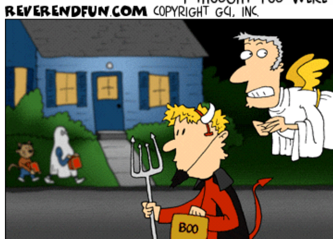
10-30-2006 SOME COSTUME CHOICES RESULTED IN VERY AWKWARD EVENINGS FOR MANY A GUARDIAN ANGEL