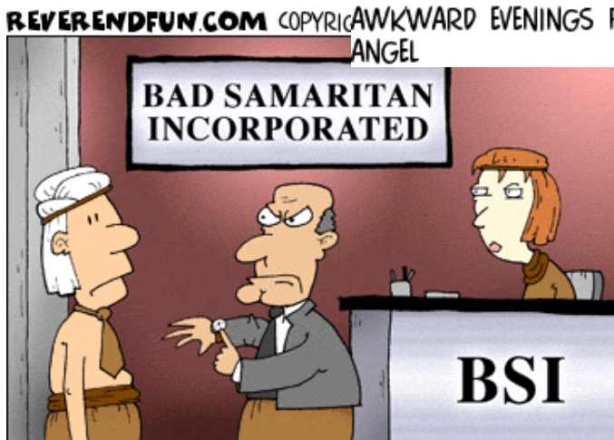
(See Luke 10:30-36) 11-07-2006 THEY NEVER UNDERSTOOD HIS "I HAD TO STOP AND HELP SOMEONE ON THE WAY IN" EXCUSE