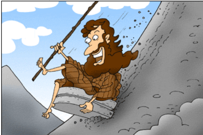
(See Exodus 34) 07-25-2006 MAN DID MOSES GET IN TROUBLE FOR THAT ONE