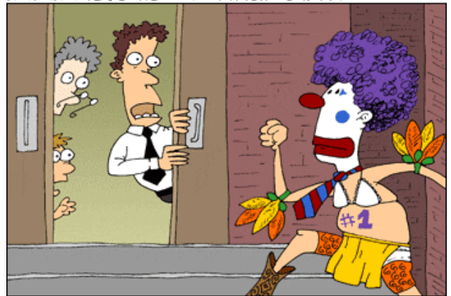
08-29-2006 THE CHURCH WAS NOT PREPARED FOR THE SURPRISE TOLERANCE DRILL