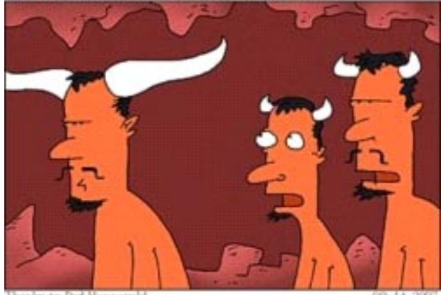
HE'S FROM TEXAS