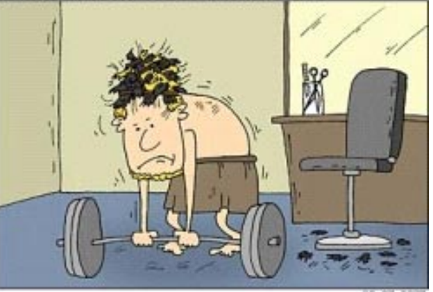
"BUMMER", THOUGHT SAMSON'S BARBER, AFTER EXPERIMENTING W/ SAMSON'S HAIR CLIPPINGS